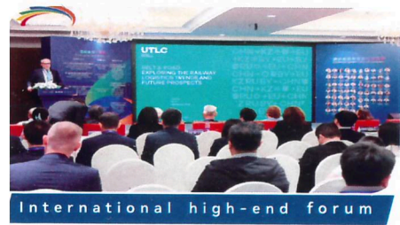
International high-end forum